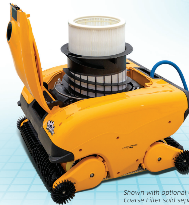
Shown with optional Cyclonic Coarse Filter sold separately.